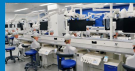
The School of Dentistry pre-clinical lab was completed during the 2019–2020 academic year and was designed to simulate a real clinical setting.

In addition to the Sunderland Foundation's contribution, donors from the School of Dentistry's Rinehart Foundation also gave generous gifts to help update the school's pre-clinical lab. The response from Dentistry alumni sprung from their personal experiences and understanding of the immediate impact the new lab will have on improving dental education for current and future students.