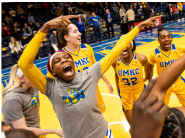
2019-20 Kansas City Women's Basketball Team

A gift to any UMKC program, whether it's athletics, academics, student success or another of the university's exemplary programs, is an investment in its strength and effectiveness.